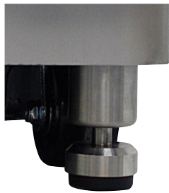
Self-leveling brakes for stability on uneven floors