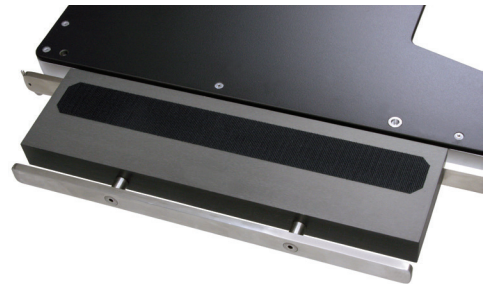
Optional 5" side extensions widen the table surface to 30"