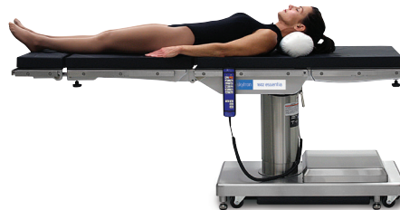
Lower Body Imaging