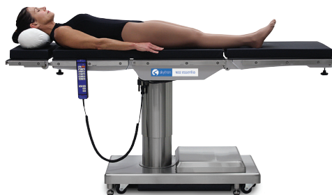
Upper Body Imaging