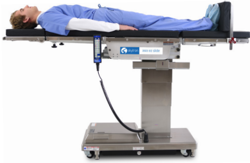
Upper Body Imaging