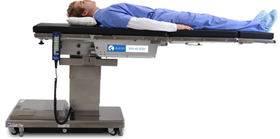
Lower Body Imaging