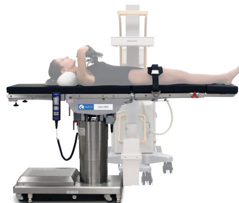
Lower Body Imaging