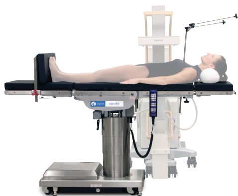
Upper Body Imaging