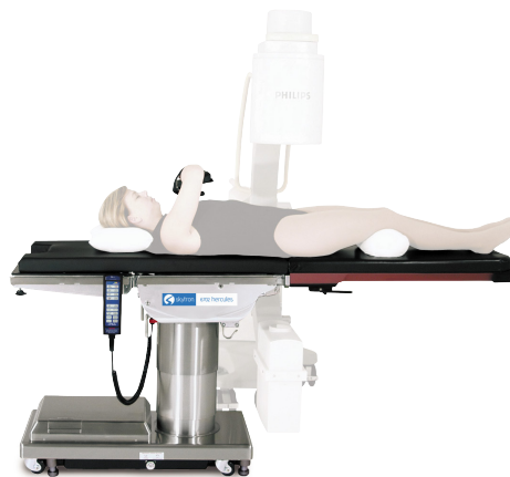
Lower Body Imaging