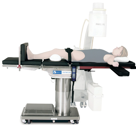
Upper Body Imaging