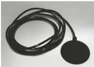
Pneumatic footswitch (included)

QUIKLINK, an automatic activation device (sold separately), can be used to remotely turn the evacuator on and off, saving filter life.