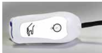
QUIKLINK (sold separately)